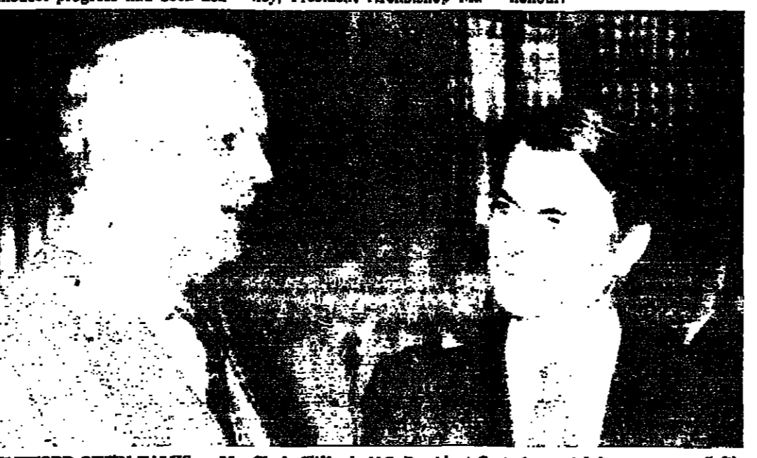
CLIFFORD-OWEN TALKS -- Mr. Clark Clifford, U.S. President Carter's special Aegean envoy (left), talks with Britain's new Foreign Secretary Dr. David Owen during their meeting at London's Foreign Office Monday.

The president said the United Nations had offered to intercede on American residents' behalf "but we've handled our affairs through the German Embassy and so far there's nothing to cause deep concern," he added.